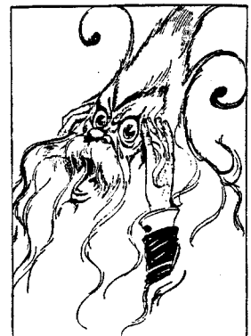
PUBLIC ENEMY NUMBER ONE

May we, her grateful and most fortunate people, never desert our loyal and gracious leader.